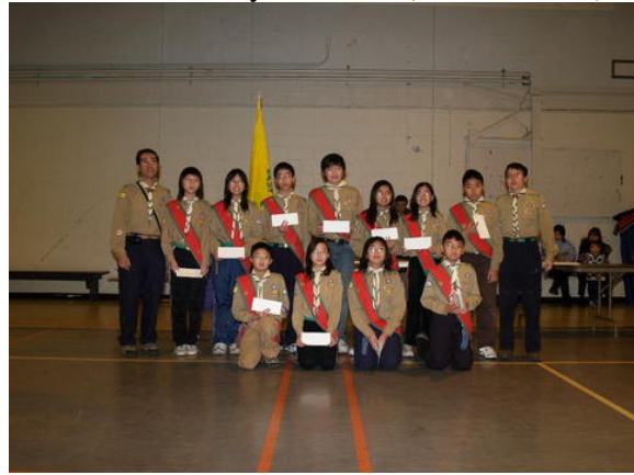
Awards for City Services (Scouts section)