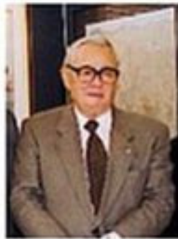
Dr. David C. Lam, Former Lieutenant-Governor of British Columbia, Canada