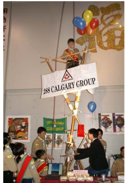
Twenty fleets look-out Tower