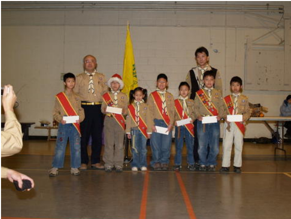
Awards for City Services (Cubs section)