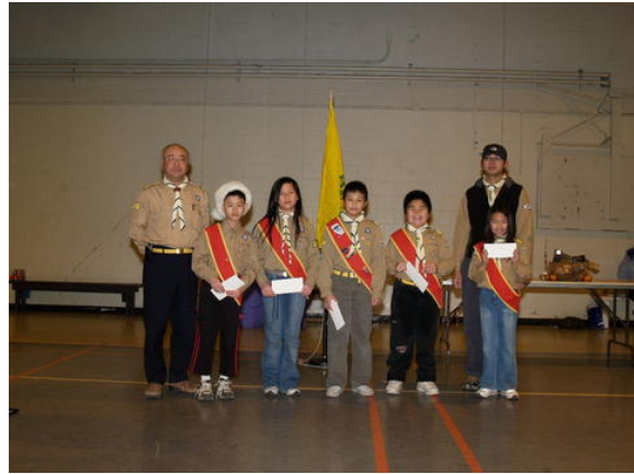
Awards for City Services (Cubs section)