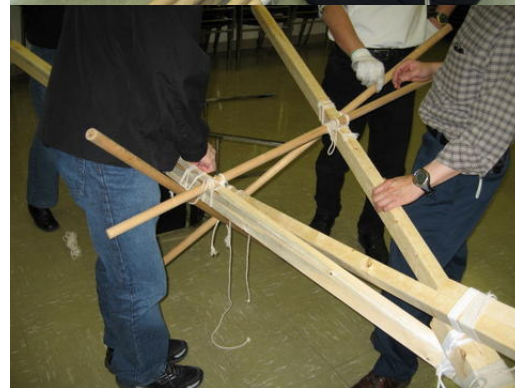
Building of the Look-Out Tower