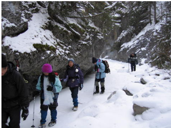
Scouts Hiking Trip (Temp -19 degree)