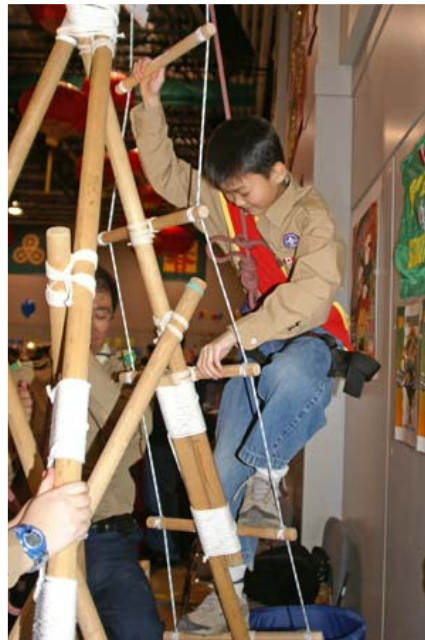
A Cub member demonstration