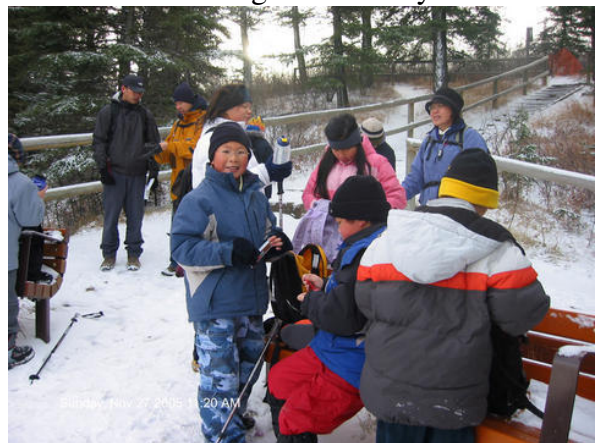
Cubs Hiking at Edworthy Park