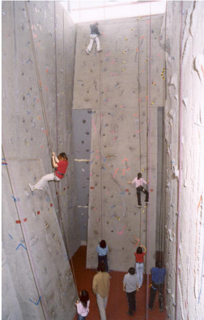
Wall Climb at U of C