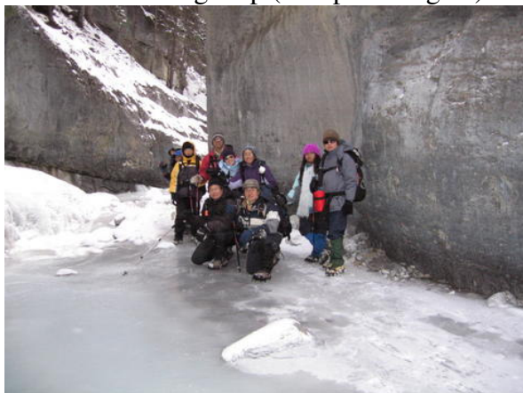
The trail was very icy