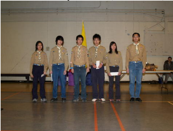
Awards for City Services (Venturer)