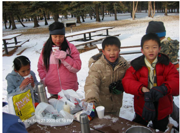
Cubs Hiking at Edworthy Park