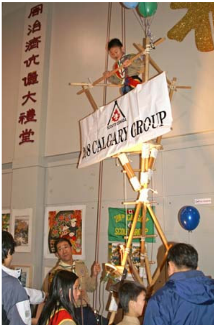
Chinese New Year at Chinese Culture Center