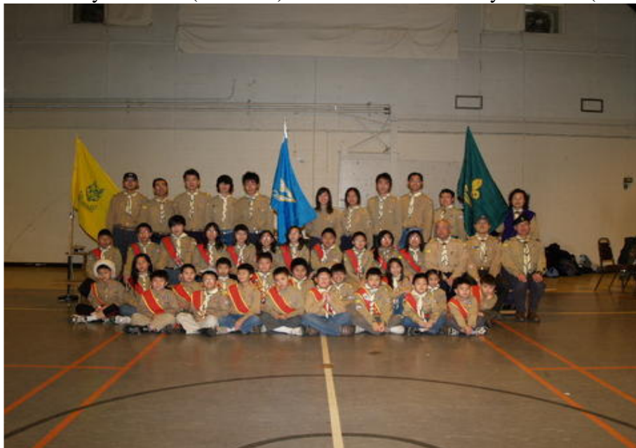
288 Calgary Chinese Group